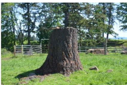
We had a stump project this year; over 400 were removed from the lower pasture!