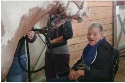
The fourth Saturday of every month we offer a special hands-on program for individuals with disabilities and those with PTSD